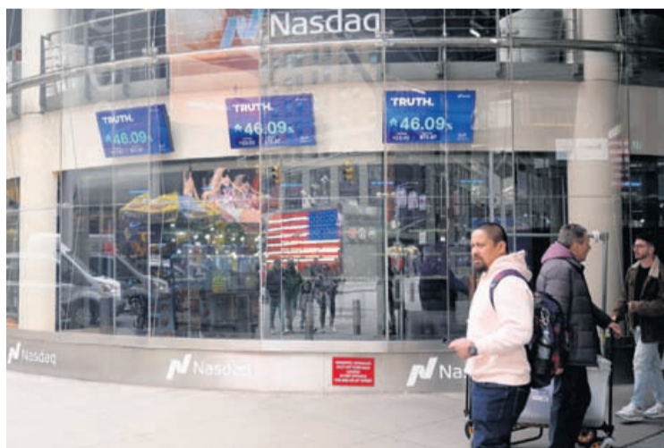
Pedestrians walk past the Nasdaq building Tuesday, March 26, 2024, in New York.