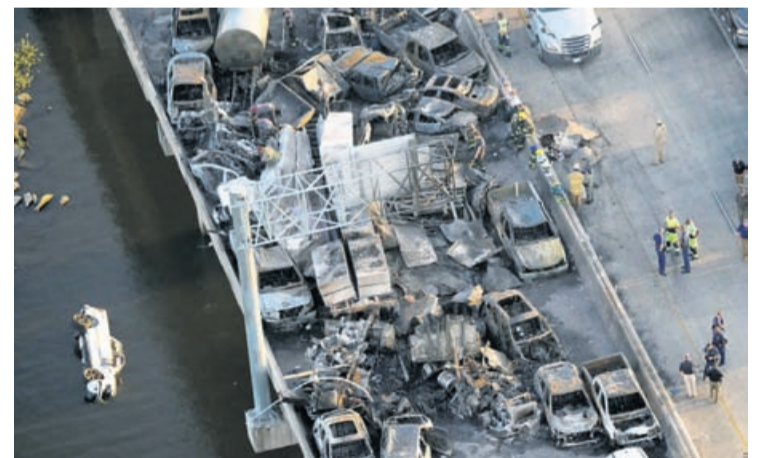
In this aerial photo, responders are seen near wreckage in the aftermath of a fatal, multi-vehicle pileup on I-55 in Manchac, La., Oct. 23, 2023.

"Distracted driving is extremely dangerous," she said while kicking off a rebranded campaign against it called "Put the Phone Away or Pay." The agency will start an advertising campaign this month,