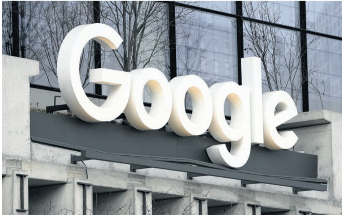
The Google building is seen in New York, Feb. 26, 2024.

The details of the deal emerged in a court filing Monday, more than three months after Google and the attorneys handling the class-action case disclosed they had resolved a June 2020 lawsuit targeting Chrome's privacy controls. Among other allegations, the lawsuit accused Google of tracking Chrome users' internet activity even when they had switched the browser to the "Incognito" setting that is supposed to shield them from being shadowed by the Mountain View, California, company. Google vigorously fought the lawsuit until U.S. District Judge Yvonne Gonzalez Rogers rejected a request to dismiss the case last August, setting up a po-