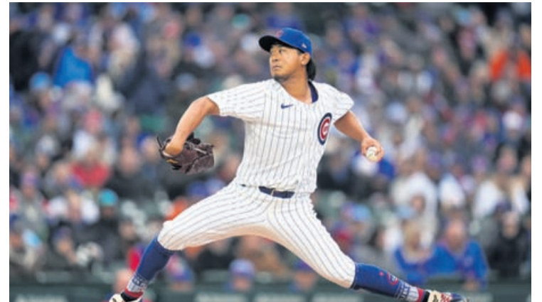
Chicago Cubs starting pitcher Shota Imanaga throws against the Colorado Rockies during the first inning of a baseball game Monday, April 1, 2024, in Chicago.

Colorado got its first baserunner when Kris Bryant reached on third baseman Morel's error in the second. But Ryan McMahon and Elias Díaz struck out swinging be-