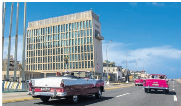
Tourists ride classic convertible cars on the Malecon beside the United States Embassy in Havana, Cuba, Oct. 3, 2017.

In February the Office of the Director of National Intelligence in its 2024 threat assessment found that it was "unlikely" that a foreign adversary was responsible for causing the mysterious ailments but noted that U.S. intelligence agencies had varying levels of confidence in that assessment. □