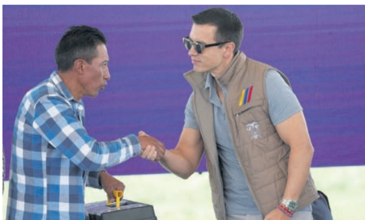
Ecuador's President Daniel Noboa shakes hands with a farmer during his visit to Poalo, Ecuador, Thursday, March 21, 2024, where he met with dairy farmers and handed out 400 land titles.