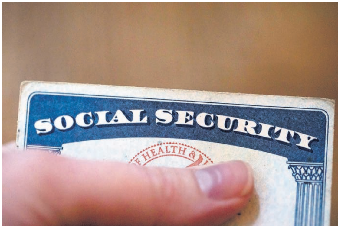
A Social Security card is displayed on Oct. 12, 2021, in Tigard, Ore.

The threshold isn't terribly high: If you're not full retirement age in 2024, you'll lose $1 in Social Security benefits for every $2 you earn above $22,320. If you will reach full retirement age this year, you'll lose $1 in benefits for every $3 you earn above $59,520, until the month you turn full retirement age. From that month forward, you're in the clear.