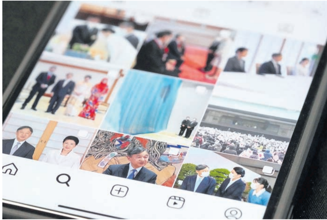
The part of the Instagram page of Japan's Imperial Household Agency is seen on a mobile phone Monday, April 1, 2024, in Tokyo.

ressing well-wishers during his Feb. 23 birthday celebrations garnered over 21,000 views in less than a day. So far, the images are limited to the family's official duties and do not include private or candid moments. The agency said it was considering adding activities of other royal members.