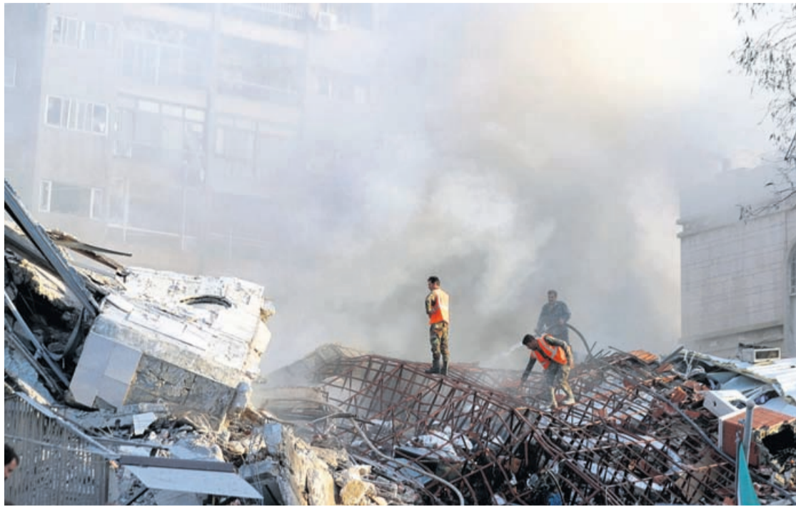
Emergency services work at a destroyed building hit by an air strike in Damascus, Syria, Monday, April 1, 2024.

Israel has grown increasingly impatient with the daily exchanges of fire with Hezbollah, which have escalated in recent days, and warned of the possibility of a full-fledged war. Iranian-backed Houthi rebels in Yemen have also been launching long-range missiles toward Israel, includ-