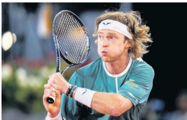
Andrey Rublev, of Russia, returns the ball to Carlos Alcaraz, of Spain, during the Mutua Madrid Open tennis tournament in Madrid, Wednesday, May 1, 2024.

their game against Indiana. The Sparks are playing their first five home games at Long Beach because of arena conflicts from construction and the NBA and NHL playoffs. They are hosting the Fever on May 24, which is scheduled to be played at Long Beach. The team's first five games will be played there in a 4,000-seat arena. □