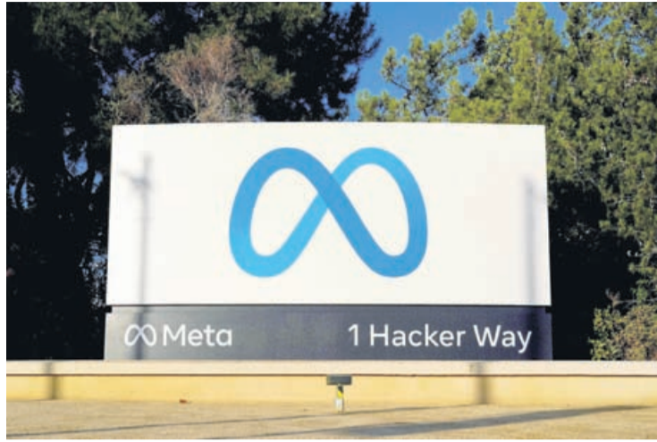
Meta's logo is seen on a sign at the company's headquarters in Menlo Park, Calif., Nov. 9, 2022.