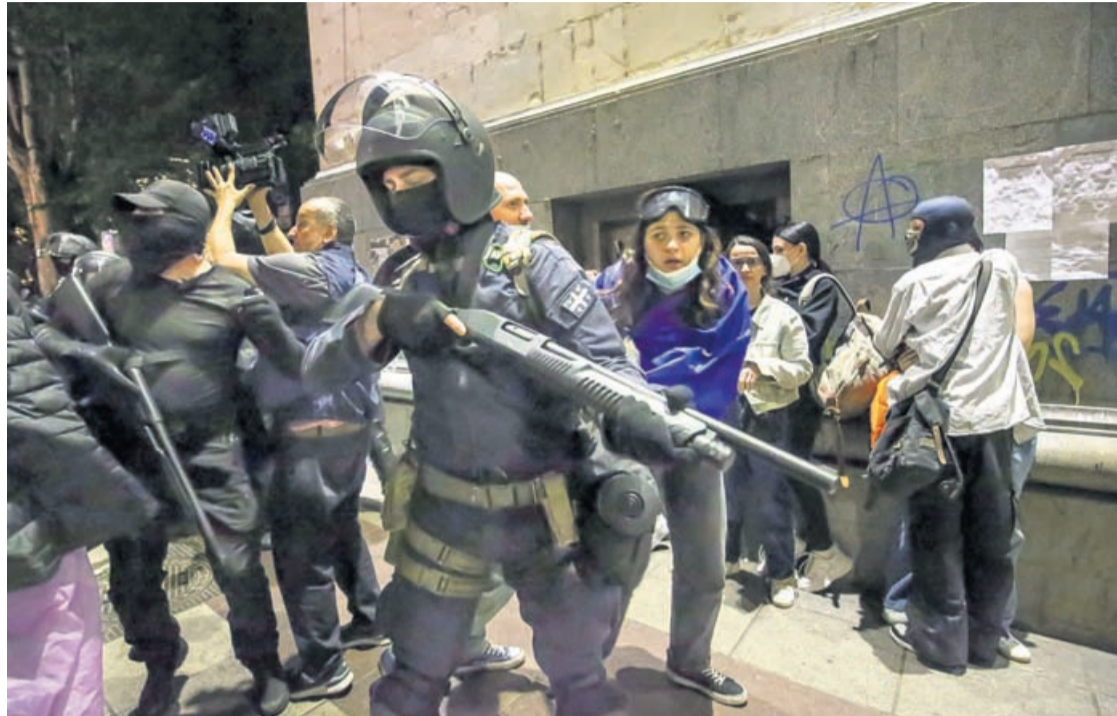
Riot policemen stand ready to fire gas grenade during an opposition protest against "the Russian law" near the Parliament building in Tbilisi, Georgia, on Wednesday, May 1, 2024.

The law would require media and noncommercial organizations to register as "pursuing the interests of a foreign power," if they receive more than 20% of funding from abroad. The ruling Georgian Dream party withdrew a similar proposal last year after large crowds protested. Eighty-three of Georgia's 150 lawmakers approved the bill in its second reading, while 23 voted against it. A third and final vote in Parliament is needed before it can be signed into law. Georgian