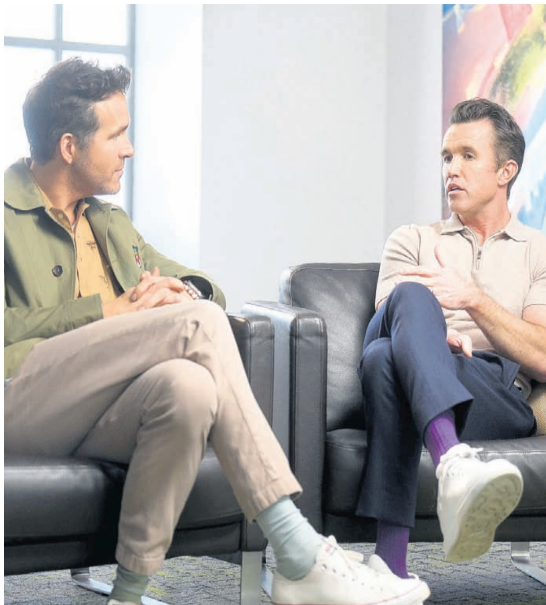
This image released by FX shows Ryan Reynolds, left, and Rob McElhenney in a scene from the third season of "Welcome to Wrexham."

As chairmen of a football club, we have to hold ourselves to a different standard. We have to have at least a modicum of decorum in our exchanges about how we talk about things, because these are human beings, not characters on a screen. These