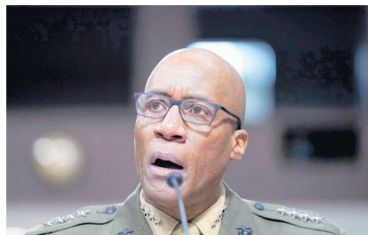
Gen. Michael Langley, USMC, Commander, U.S. Africa Command, testifies during a Senate committee hearing on Senate Armed Services hearing to examine the posture of United States Central Command and United States Africa Command, Thursday, March 16, 2023, on Capitol Hill in Washington.

Langley said. Government officials in Chad couldn't immediately be reached for comment. The presidential election in Chad is scheduled for Monday, and analysts expect the incumbent to win. Chad's interim president, Mahamat Deby Itno, seized power after his father, who ran the country for more than three decades, was killed fighting rebels in 2021. Last year, the government announced it was extending the 18-month transition for two more years, which led to protests across the country. Langley said the withdrawal of U.S. forces was a temporary step "as part of an ongoing review of our security coop-