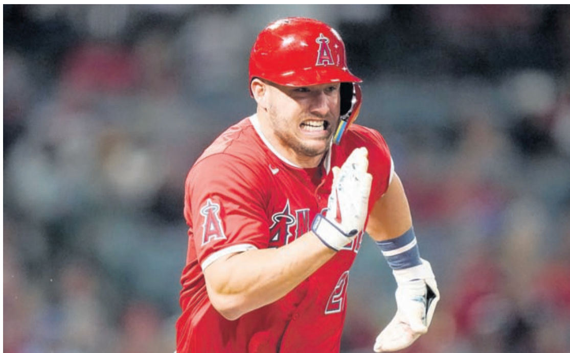
Los Angeles Angels' Mike Trout runs after a single during the seventh inning of a baseball game against the Philadelphia Phillies, Monday, April 29, 2024, in Anaheim, Calif.

ANAHEIM, Calif. (AP) — Mike Trout never had a significant injury in his charmed baseball career until May 2017, when he tore a thumb ligament sliding headfirst into second base. On his first day back from a 39-game absence, the superstar slugger stole second — and he slid headfirst again. "I'm not changing the way I play," a grinning Trout said that night in the Los Angeles Angels' clubhouse, a singular young athlete confident in his exceptionalism. Less than seven years later in the hallway outside that same Anaheim clubhouse, Trout repeatedly fought back tears Tuesday while he publicly processed his fourth major