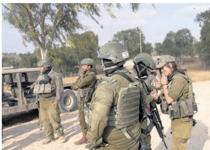
Israeli soldiers gather near the Israeli-Gaza border in southern Israel before they enter Gaza Strip, Wednesday, May 1, 2024.