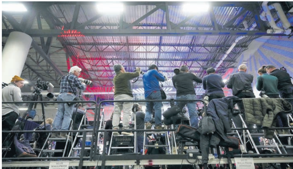
Journalists line the press stand before Republican presidential candidate former President Donald Trump speaks at a caucus night party in Des Moines, Iowa, Jan. 15, 2024.

Years of suspicion about journalists, much of it sown by poli-