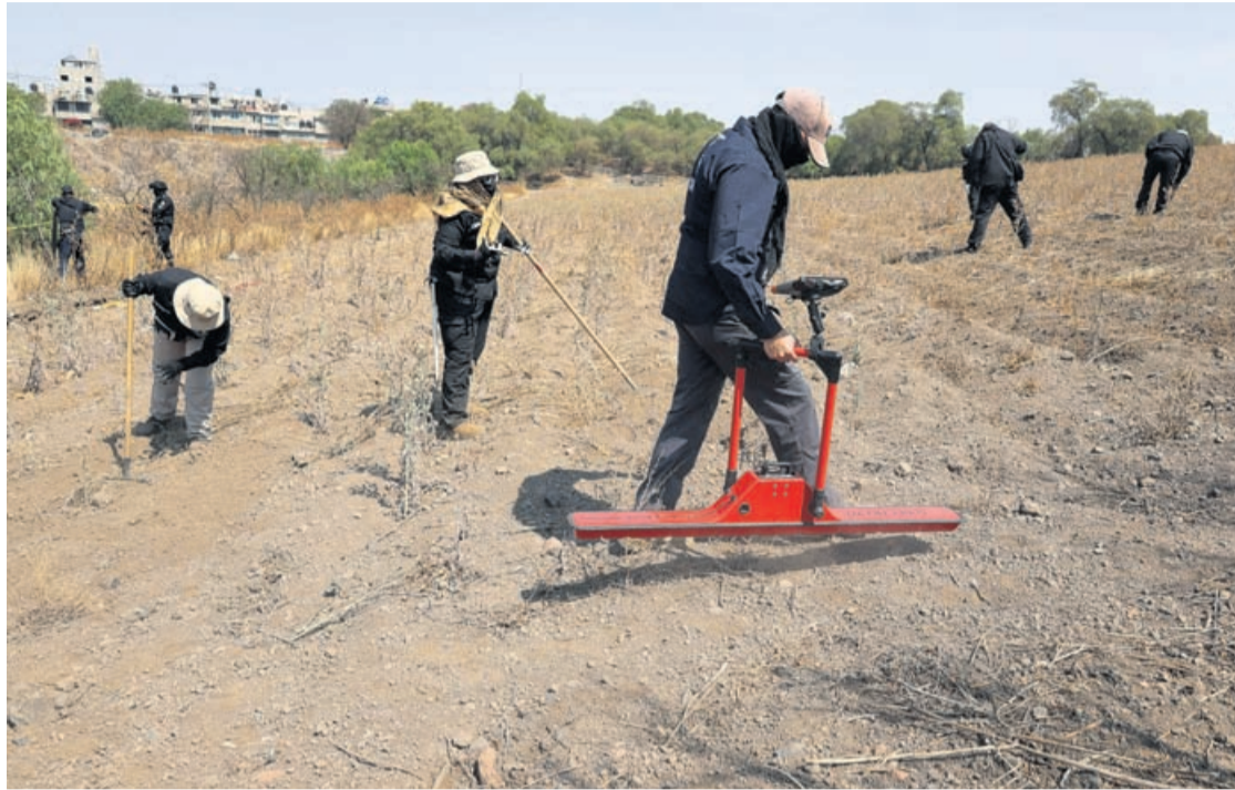
A member of the National Search Commission uses a ground-penetrating radar in an area where volunteers said they have found a clandestine crematorium in Tlahuac, on the edge of Mexico City, Wednesday, May 1, 2024.