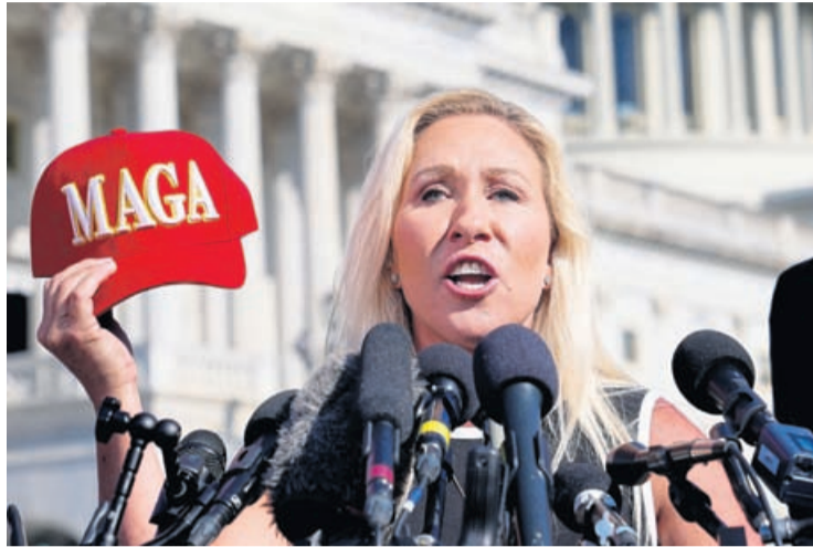
Rep. Marjorie Taylor Greene, R-Ga., says she'll call a vote next week on ousting House Speaker Mike Johnson, R-La., during a news conference at the Capitol in Washington, Wednesday, May 1, 2024.

Democrats see in Johnson a potential partner, a hard-line conservative who nevertheless is willing to lead his Republican Party away from the far-right voices obstructing the routine business of governing, including funding the government and, more recently, supporting Ukraine and other U.S. allies overseas.