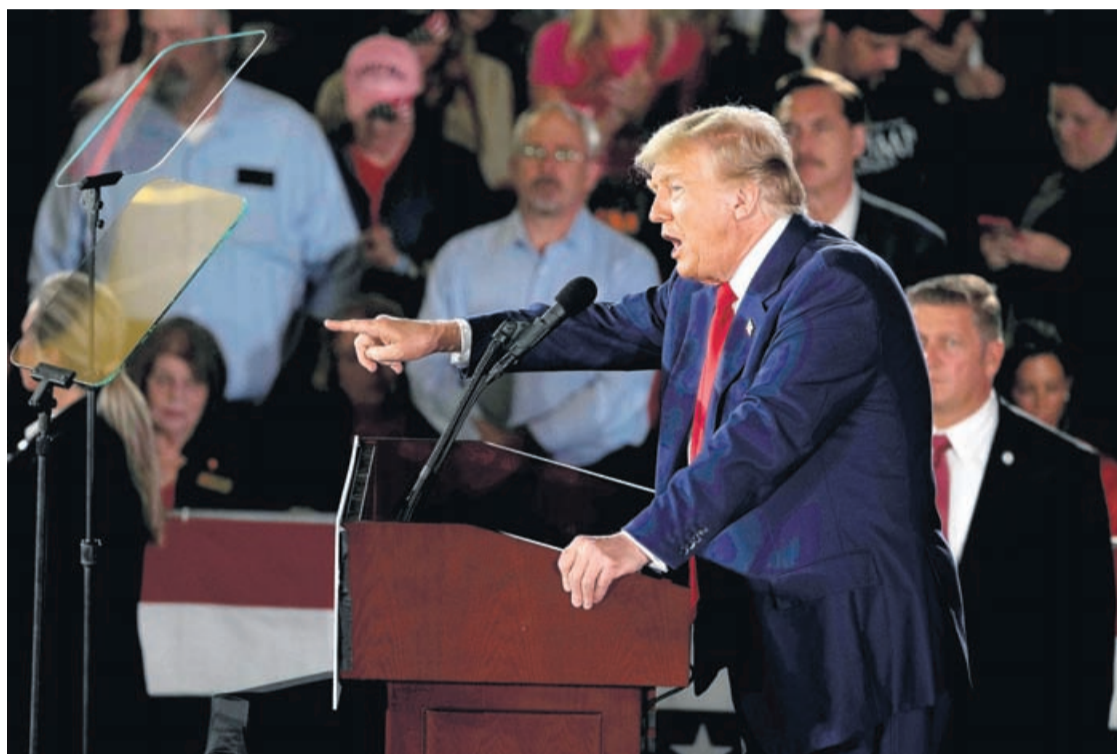
Republican presidential candidate former President Donald Trump speaks at a campaign rally on Wednesday, May 1, 2024, at the Waukesha County Expo Center in Waukesha, Wis.

Hours later, New York police stormed the campus building the protesters had occupied and arrested several dozen people. The scene prompted Trump during a Wednesday rally in Wisconsin to characterize New York as being "under siege" the night before. New York City Mayor Eric Adams said those who had taken over the Columbia building would face charges that included burglary, trespassing and criminal mischief.